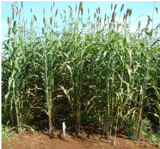
Sugar profile of juice* extracted from stems of the sweet sorghum variety BRS 508

BRS 508 is a variety developed by Embrapa Maize and Sorghum to meet the growing demand for complementary feedstock as an alternative to sugarcane for ethanol production. This cultivar has high yield potential of stems (average 50-70 t ha -1 ) and high levels of fermentable sugars in the juice (total sugar 18-20 g L -1 at the maturity peak), 2.0 t ha -1 grain yield, and resistance to lodging and to major pathogens. Average maturity cycle for the production of ethanol is about 115-125 days after sowing, and with a period of industrial utilization (PUI) of more than 30 days.