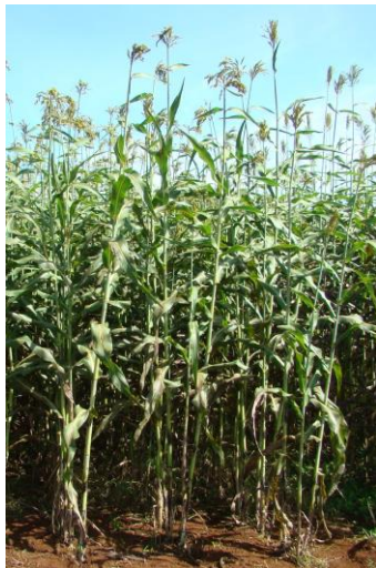
Sugar profile of juice* extracted from stems of the sweet sorghum variety BRS 509

BRS 509 is a variety developed by Embrapa Maize and Sorghum to meet the growing demand for complementary feedstock as an alternative to sugarcane for ethanol production. This cultivar has high yield potential of stems (average 60-80 t ha -1 ) and high levels of fermentable sugars in the juice (total sugar 16-20 g L -1 at the maturity peak), 2.0 t ha -1 grain yield, and resistance to lodging and to major pathogens. Average maturity cycle for the production of ethanol is about 115-125 days after sowing, and with a period of industrial utilization (PUI) more than 30 days.